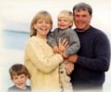
Meet a New Member ~ page 4

We wanted to recognize and offer our gratitude to our Founding Members. From the Club's inception, nearly two year ago, their confidence, support and encouragement were instrumental in moving the project forward. We would also like to welcome the families who have already been accepted for membership. This summer we are planning a series of events that will offer the opportunity to get together and renew old friendships and meet new members of the Club. We look forward to seeing all of you at these events and sharing ideas on the future operations of our facilities.