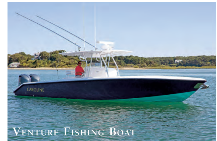
VENTURE FISHING BOAT