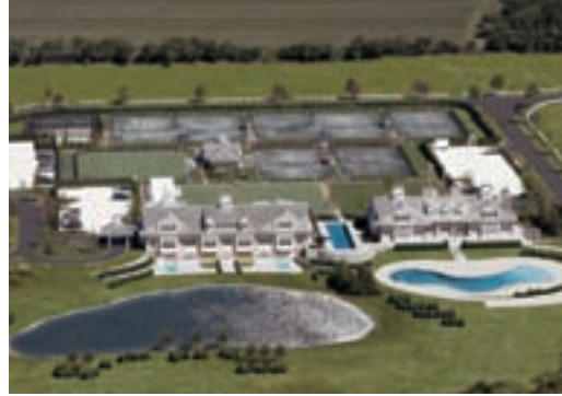
The Field Club & Pools