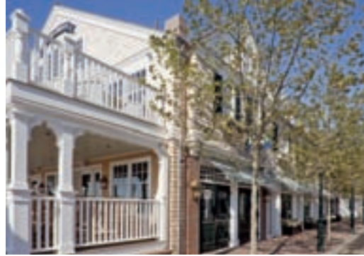
Main Entrance Downtown