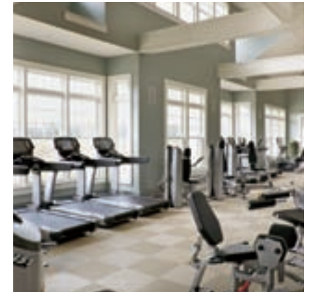
T E N N I S • F I T N E S S C E N T E R • P O O L S • S P A