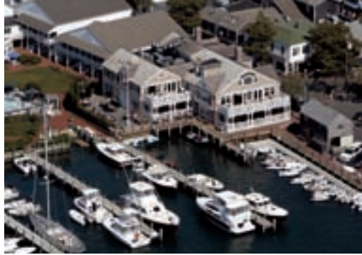
The Boathouse Restaurant & Docks