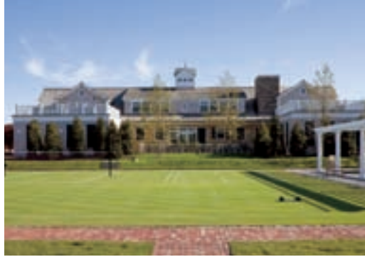
Fitness Center & Spa