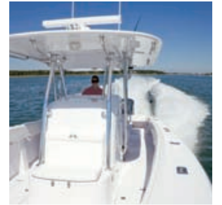
W A T E R F R O N T D I N I N G • B A R • B O A T I N G